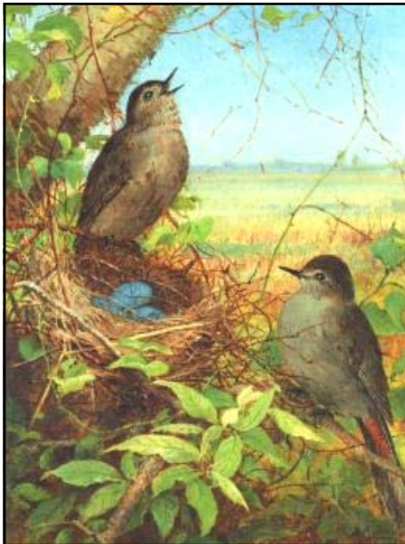
Thrushes Nest, 1878