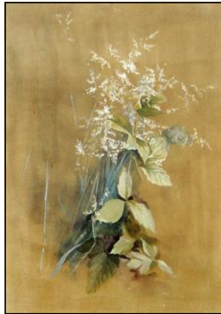
(above) Grass and Poison Ivy , 1878