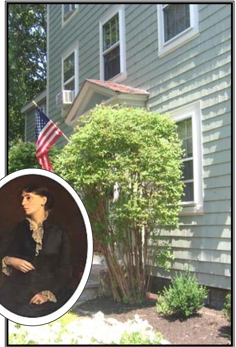
Childhood home of 19th Century artist Fidelia Bridges